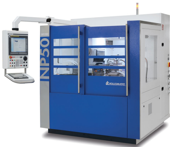
Rollomatic ShapeSmart® NP50 pinch/peel grinding machine

This machine is also ideal for blank preparation of cutting tool blanks in the industrial, medical and dental markets.